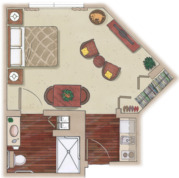
Sunfish Studio, One Bathroom 350 to 370 Square Feet

Floor plans are for general reference only and are not to scale. Features, materials, finishes and layout of unit may be different than shown.