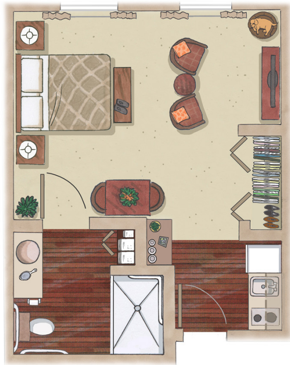
Johanna Studio, One Bathroom 350 to 370 Square Feet

Floor plans are for general reference only and are not to scale. Features, materials, finishes and layout of unit may be different than shown.