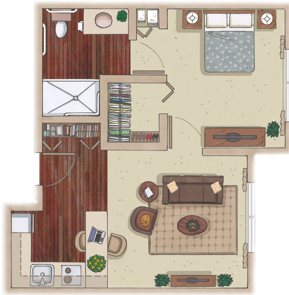
Crosby One Bedroom, One Bathroom 526 to 658 Square Feet

Floor plans are for general reference only and are not to scale. Features, materials, finishes and layout of unit may be different than shown.