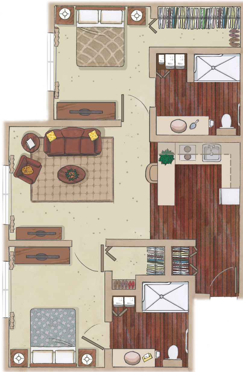
Harriet Two Bedroom, Two Bathroom 876 to 1058 Square Feet

Floor plans are for general reference only and are not to scale. Features, materials, finishes and layout of unit may be different than shown.