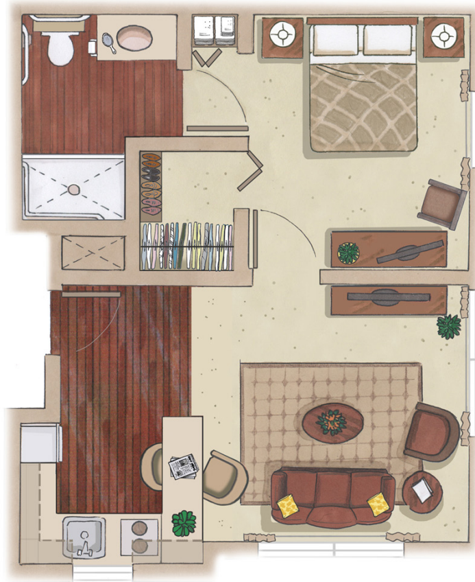
Como One Bedroom, One Bathroom 526 to 658 Square Feet

Floor plans are for general reference only and are not to scale. Features, materials, finishes and layout of unit may be different than shown.