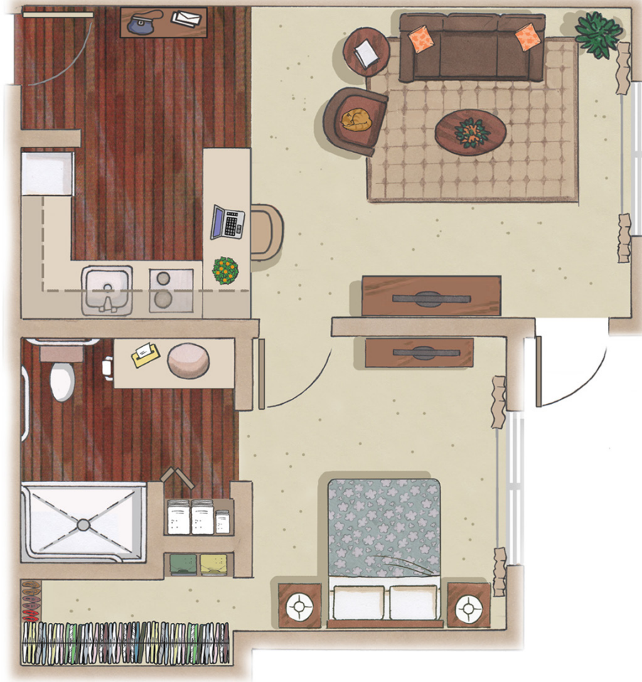
Calhoun One Bedroom, One Bathroom 526 to 658 Square Feet

Floor plans are for general reference only and are not to scale. Features, materials, finishes and layout of unit may be different than shown.