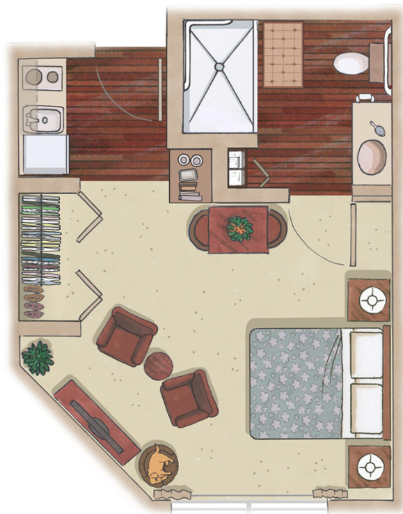
Pepin Studio, One Bathroom 350 to 370 Square Feet

Floor plans are for general reference only and are not to scale. Features, materials, finishes and layout of unit may be different than shown.